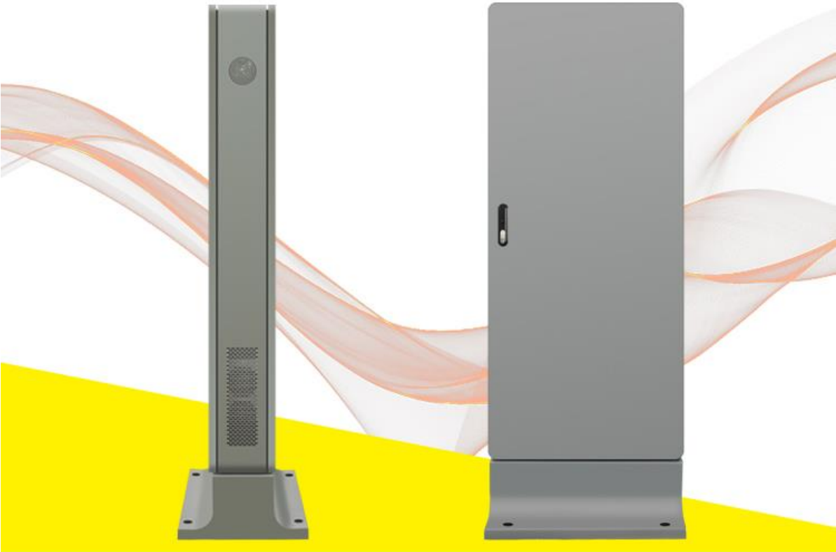
— Side —