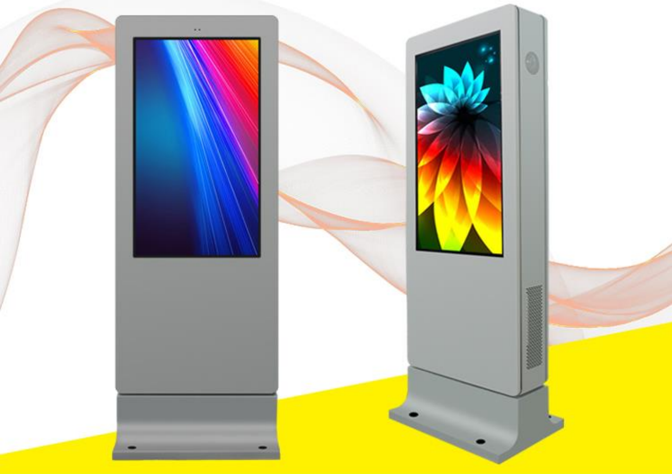
— front —